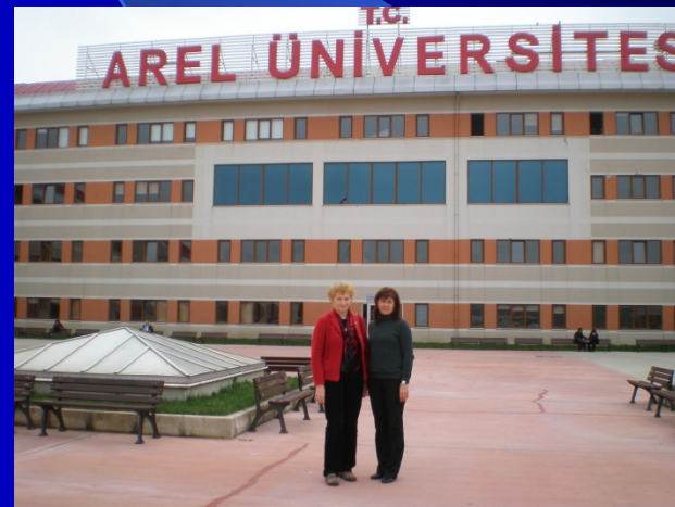
Arel University, Turkey, 2011