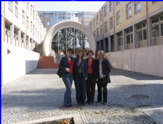
ISCAP, Portugal, 2007