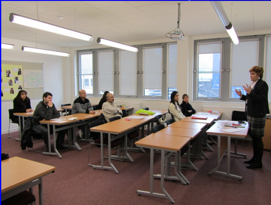
Langside College Glasgow, Great Britain, 2011