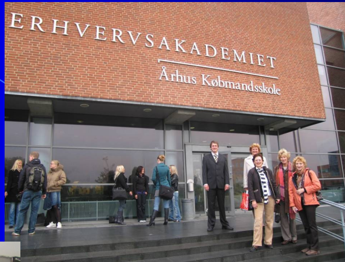
Aarhus Business College, Denmark, 2007