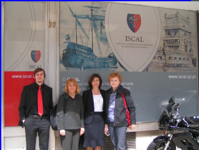
ISCAL, Portugal, 2009